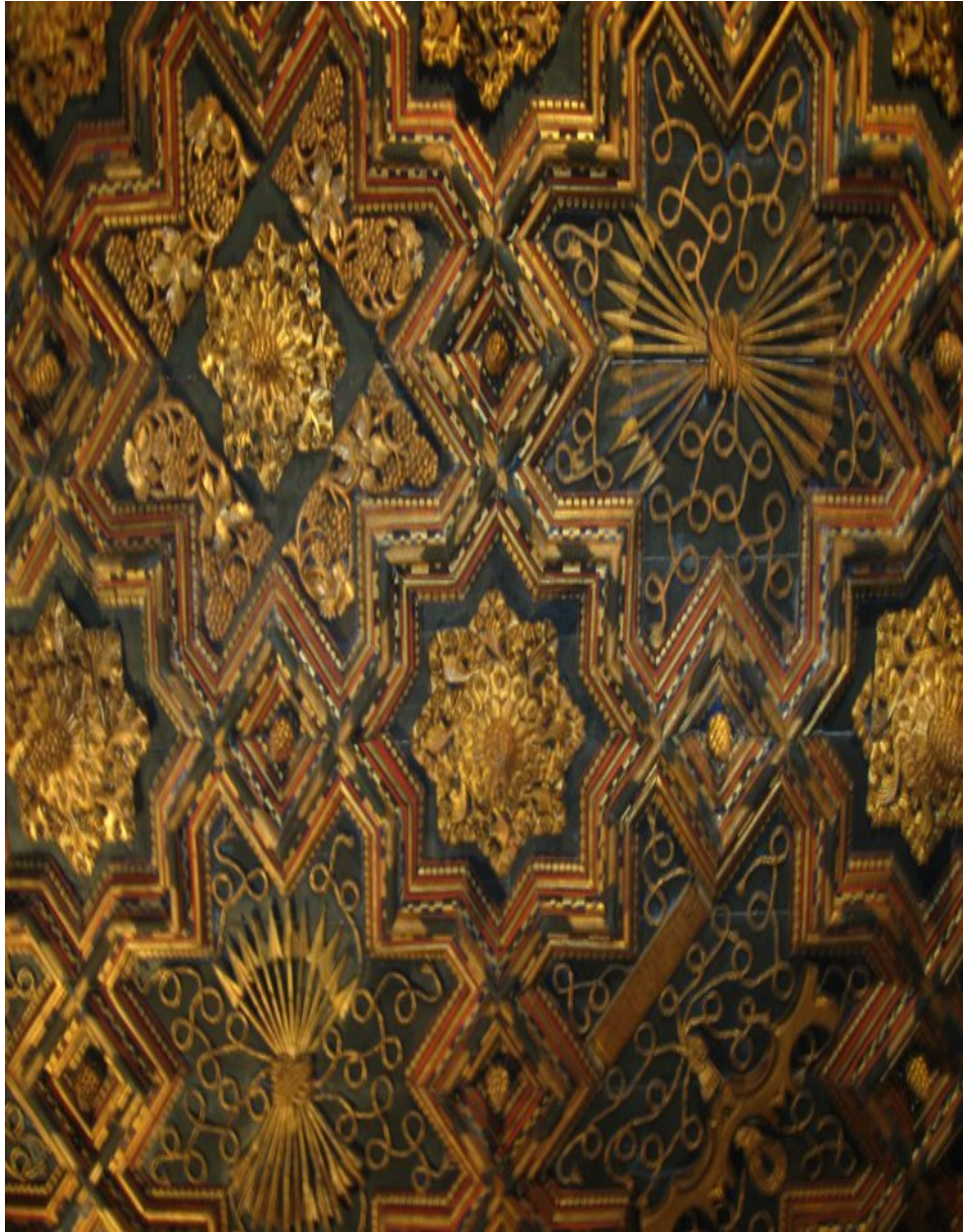
The carpets here are marvelous. Some of them are very old, and have the beautiful look of well-made antiques. I have commissioned you a carpet from some weavers in the village. Their pattern is very unusual for carpets of this region. --The Persian general, first series, fourteenth letter.